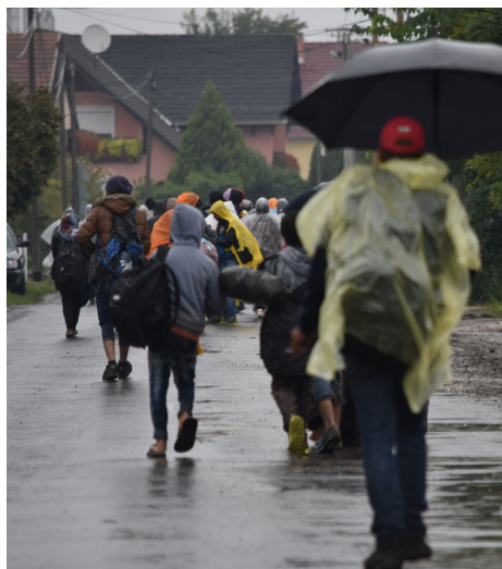
Finding a way in the rain

The sheer numbers of people have led to questions about the import of radical Islam, about the differences between politically versus economically motivated immigration, and about the response of Christians and the Church. In the current crisis, the pressure upon the European church to respond has created waves of fear and a variety of reactions. Picking up a political lens, an economic lens, or even a historical-religious lens can bring a variety of issues into focus.