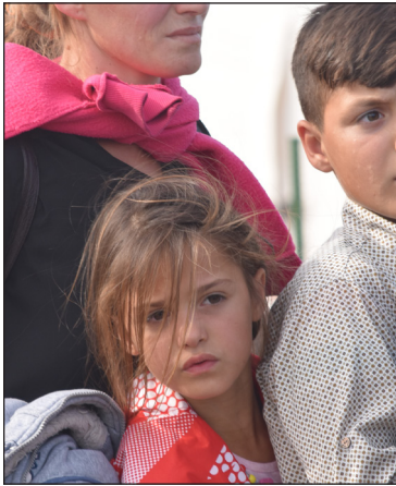
Syrian children wait to board a bus in Hungary