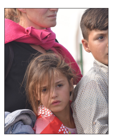
Syrian children wait to board a bus in Hungary