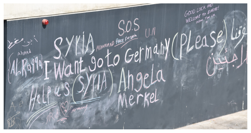
Message left on a wall in Keleti Train station, Hungary

are to treat the foreigner, the migrant, the religiously different, and the enemy amongst us. The Mitzvah of Leket is for every kind of poverty and it is through God's people that the provision for the celebration comes. Indeed, the poor will glean as the servants leave room at the edges of their lives. Not only that, but the servants are told to disrupt the order that they have already established in the harvest, they are to pull some out from the bundles they have already prepared and leave it at the edges. This is not only radical for the ancient hearers, but it also a radical call to obedience in the 21st century.