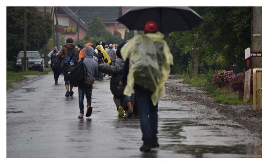
Finding a way in the rain

This is the same courage that has propelled hundreds of thousands of refugees from Syria, Iraq, Afghanistan, Pakistan, and Northern Africa to set out for Europe. They face unbelievable obstacles: treacherous sea crossings, dishonest people who steal and beat them, unwelcoming borders where sometimes they must sneak across, hunger, cold, days